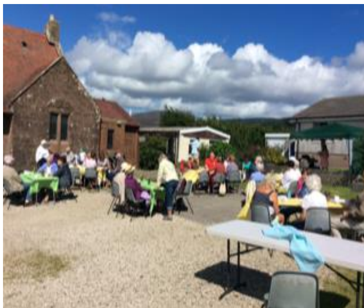
Warm room photo